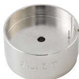
Movement holder Removing setting stem HZXX.1T