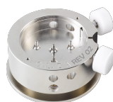
Movement holder Setting hands HZXX.2A