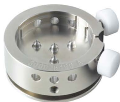
Movement holder Setting hands H8XXX.1A