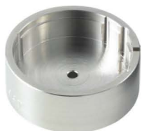
Movement holder Removing setting stem H8XXX.1T