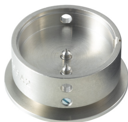
Movement holder Setting hands H7XXX.1A