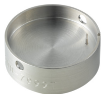
Movement holder Removing setting stem H7XXX.1T