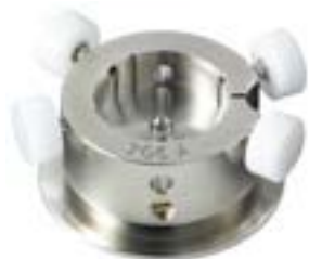
Movement holder Setting hands H706.1A