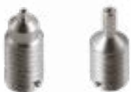
Supporting screws centre/edge Swiss made movement holder .0.8mm/1.4mm