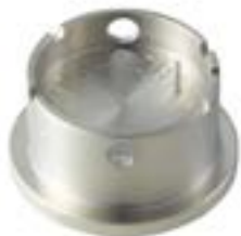
Movement holder Removing setting stem H70X.1T