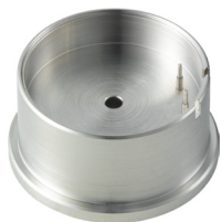
Movement holder Removing setting stem H6XXX.1T