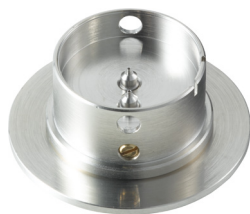
Movement holder Setting hands H6XXX.1A2