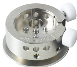
Movement holder Setting hands H5XXX.1A