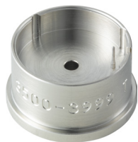
Movement holder Removing setting stem H35XX.1T