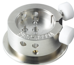
Movement holder Setting hands H35XX.1A