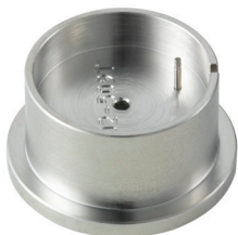
Movement holder Removing setting stem H5XXX.1T