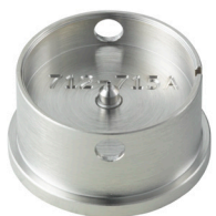
Movement holder Setting hands H71X.1A