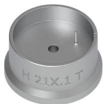
Movement holder Removing setting stem H21X.1T