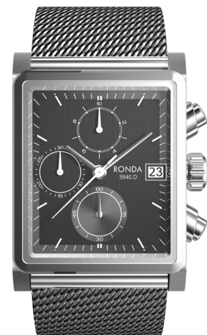
all images in 100% scale