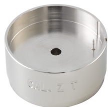
Movement holder Removing setting stem H ZXX.1T