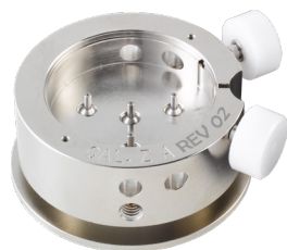
Movement holder Setting hands H ZXX.2A