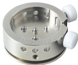
Movement holder Setting hands H8XXX.1A