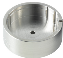
Movement holder Removing setting stem H8XXX.1T