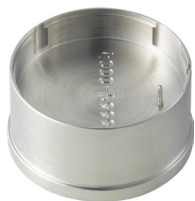
Movement holder Removing setting stem H5XXX.1T