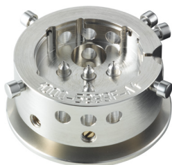
Movement holder Setting hands H5XXF.1A