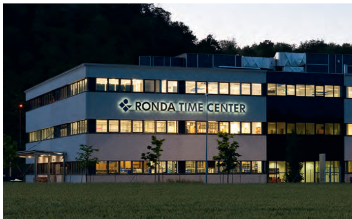
Production site in Stabio since 2008

Ronda Time Center is a leader in the assembly of Swiss watches. We maintain a close partnership with our customers and our comprehensive value-added benefits allow us to offer high quality at attractive conditions.