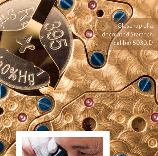
Close-up of a decorated Startech caliber 5030.D