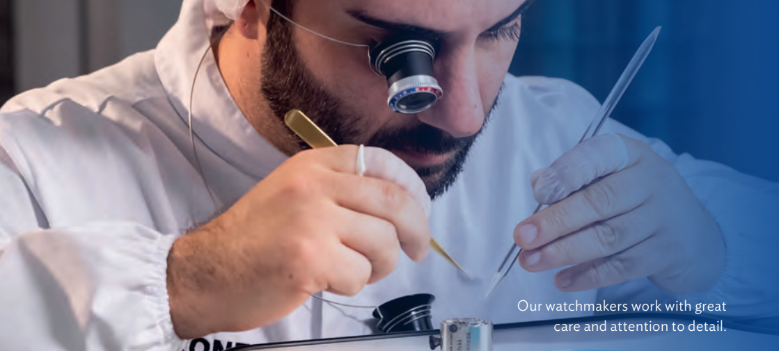
Our watchmakers work with great care and attention to detail.