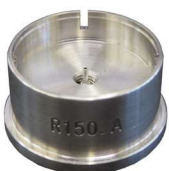
Movement holder Setting hands H ZXX.2A