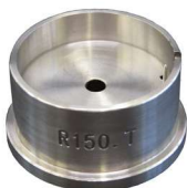
Movement holder Removing setting stem H ZXX.1T