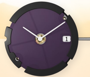
Cal. 214 2 Hands, Date