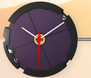
Cal. 213 3 Hands